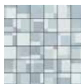
30x30 Paper Mosaico SURETE Avio 11