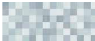
25x60 Paper Mosaico Avio 9