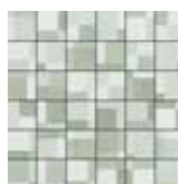
30x30 Paper Mosaico SURETE Salvia 11