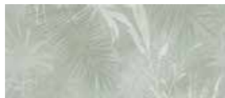
25x60 Paper Decoro Leaf Salvia* (3 soggetti: A-B-C) 9

rivestimento in bicottura Double-fired wall tile spessore thickness 8 mm