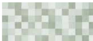
25x60 Paper Mosaico Salvia 9