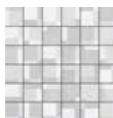
30x30 Paper Mosaico SURETE Grigio 11