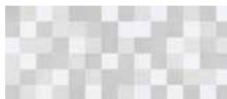
25x60 Paper Mosaico Grigio 9