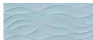
25x60 Calipso Wave Sky