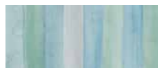
25x60 Calipso Brick Multicolor