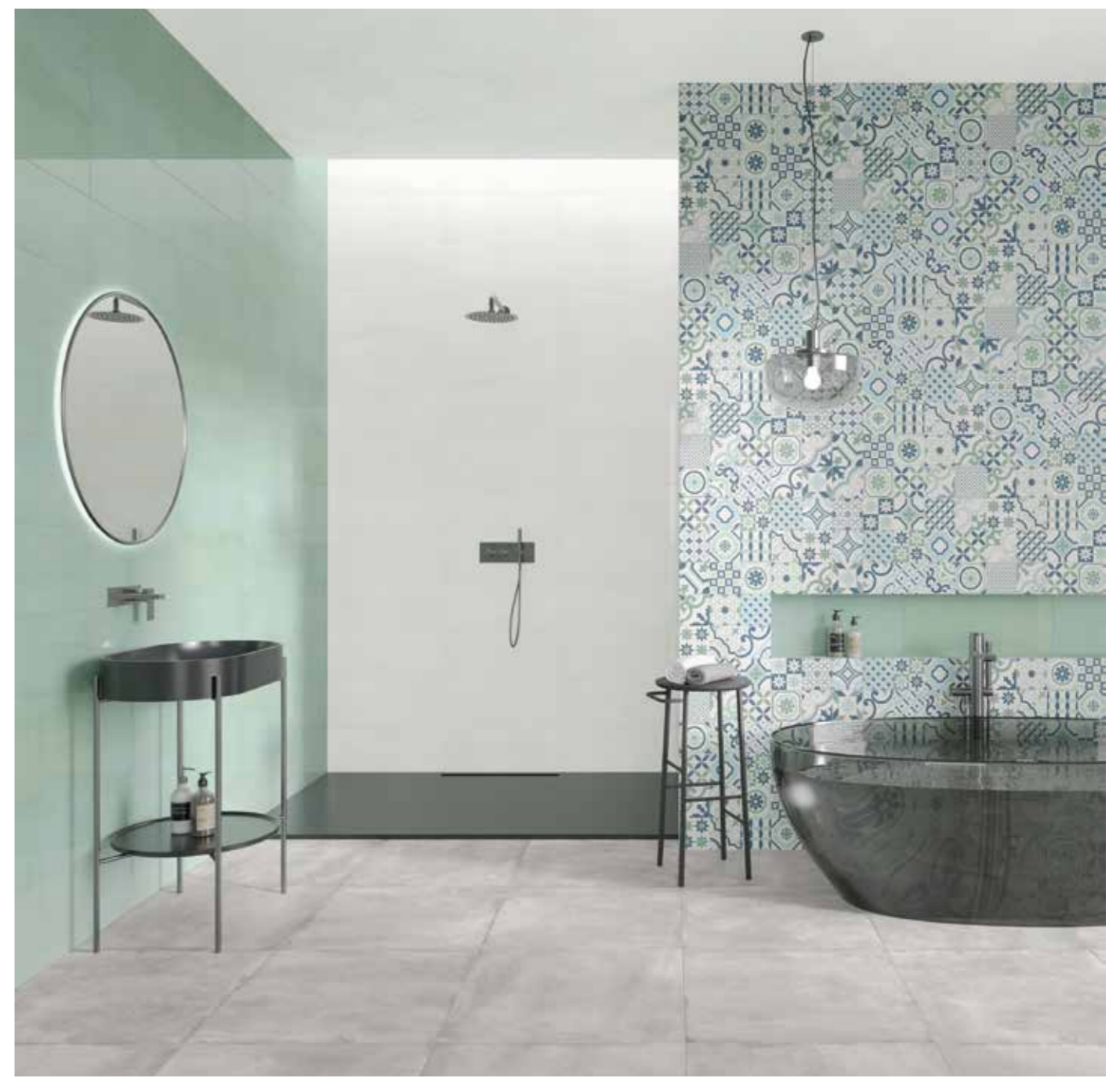
CALIPSO CEMENTINA 25x60 / MINT 25x60 / ICE 25x60 / MATERIA SILVER 60x60 RETTIFICATO