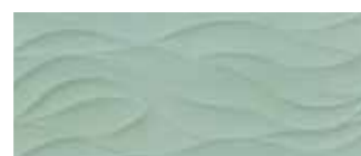
25x60 Calipso Wave Mint