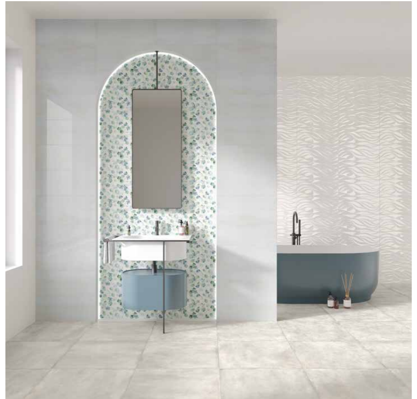
CALIPSO BOTANICAL 25x60 / WAVE ICE 25x60 / GREY 25x60 / MATERIA WHITE 60x60 RETTIFICATO