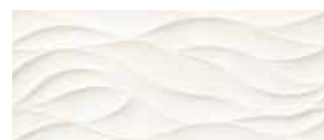
25x60 Calipso Wave Ice