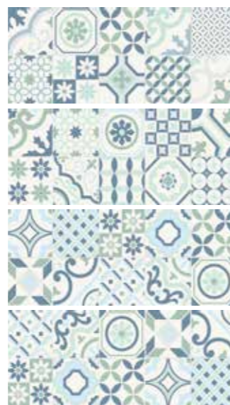
25x60 Calipso Cementina