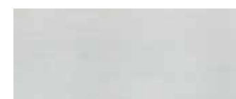
25x60 Calipso Grey