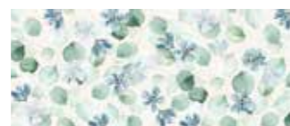
25x60 Calipso Botanical